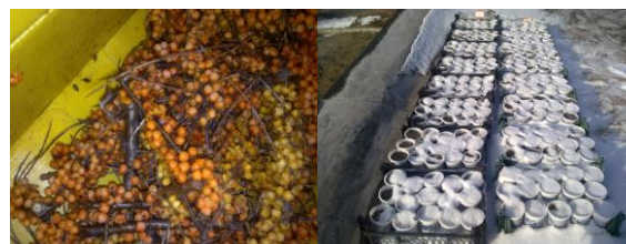
Fig. 1. Sea buckthorn berry (Left), seeds in pots in winter season

Comparisons of results SNK mean separation at 5% level replication, irrigation, soil and pretreated are as follows: 1) Grouping all iterations for all parameters in group A was the one, 2) Grouping for irrigation: a group for all indices except days to germination index was in the 2 group, 3) Grouping soils: all were classified in four groups except germination energy and germination values were in the 3 groups and 4) Grouping in Pretreatments: in Table 5 it is indicated that some groups have similarities.